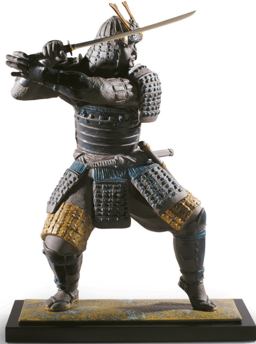
01009230 SAMURAI WARRIOR Base included 23 1/2 x 17 1/4"