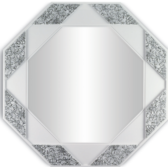
01007159 EIGHT SIDED MIRROR (BLACK & WHITE) 31½ x 31½"