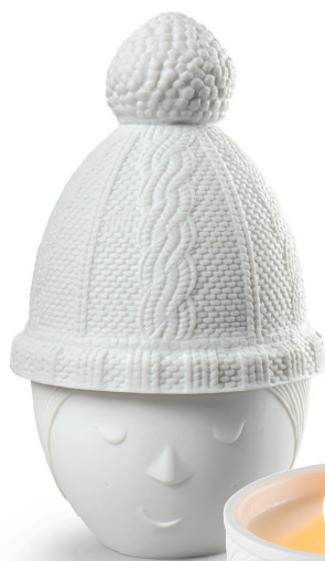
01040153 WINTER LEE CANDLE 7 x 4"