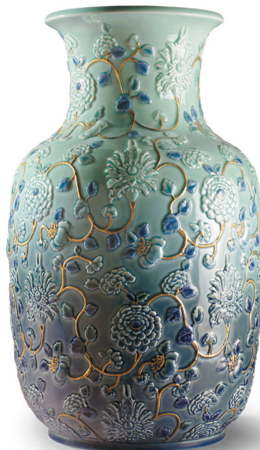
01009211 PEONIES VASE 16½ x 9½"