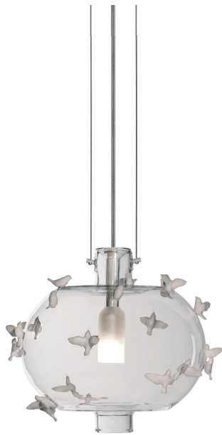
01017047 FREEZE FRAME I HANGING LAMP (US) 67 x 9½"

The German Designer Bodo Sperlein focused on Nature using delicate elements of existing brand's pieces to create design lead products for Lladró's Re-Cyclos project. A collection of surprising decorative and functional pieces that underline the beauty and quality of detail of all Lladró works.