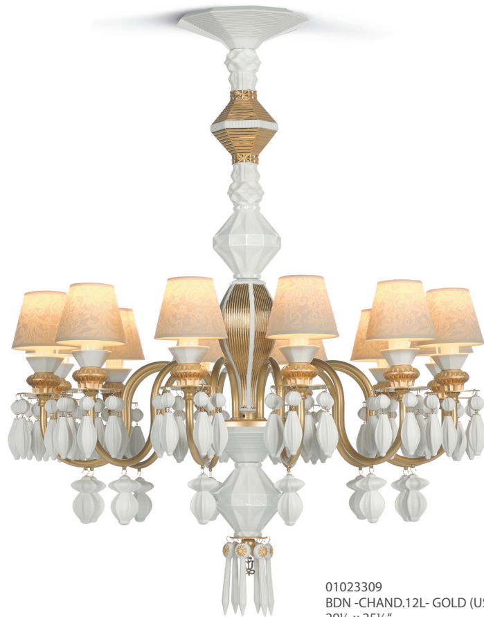
01023309 BDN -CHAND.12L- GOLD (US) 29½ x 25½"