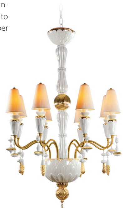
01023802 IVY&SEED CHANDELIER 8 L. WHITE GOLD 41¼ x 27½"