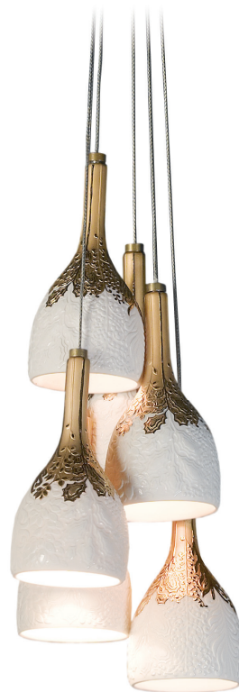
01023149 NATUROFANTASTIC 6 LIGHTS LAMP (US) 67 x 15¾"