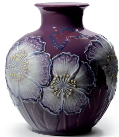
01008621 POPPY FLOWERS VASE (PURPLE) 11 x 9¾"