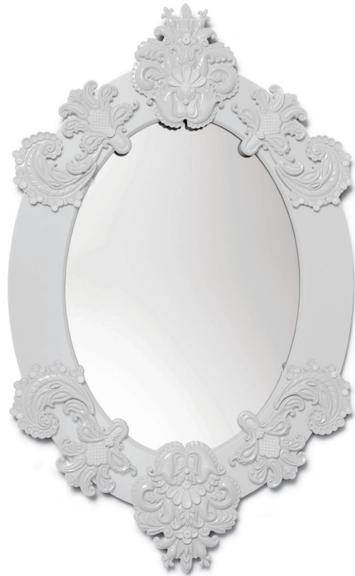
01007773 OVAL MIRROR (WHITE) 36½ x 22¾"