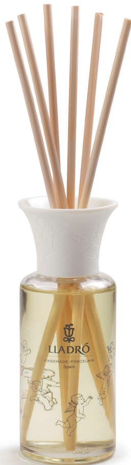
PERFUME DIFFUSER 9½ x 2¼"