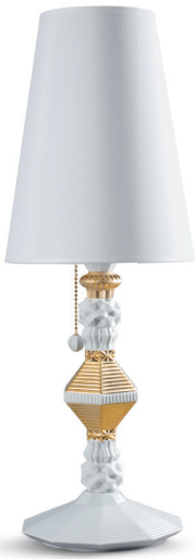
01023322 BDN -TABLE LAMP- GOLD (US) 22½ x 7¾"

Lladró's Belle de Nuit lamps speak to us in a new language of porcelain and color. They give off a warm light thanks to the lithophanes as shades, engraved with different decorative motifs. The rest is down to the wealth of Lladró's palette of colors: from the most classic model in white to the fun multi-color version, Belle de Nuit lamps decorate, illuminate and, above all else, add that exclusive magical touch to your favourite rooms.