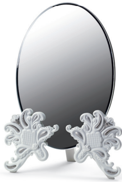
01007831 VANITY MIRROR (WHITE / SILVER) 16¼ x 11½"

Lladró mirrors reinvent every space in your home. Porcelain objects in original finishes and colors, which fit in every decorative atmosphere. The ample Lladró mirrors catalogue includes detailed ornamented designs, geometrical and organic looking pieces and mirrors in very pure and casual shapes. Exclusive creations, some of limited edition, which adapt to every location and space.