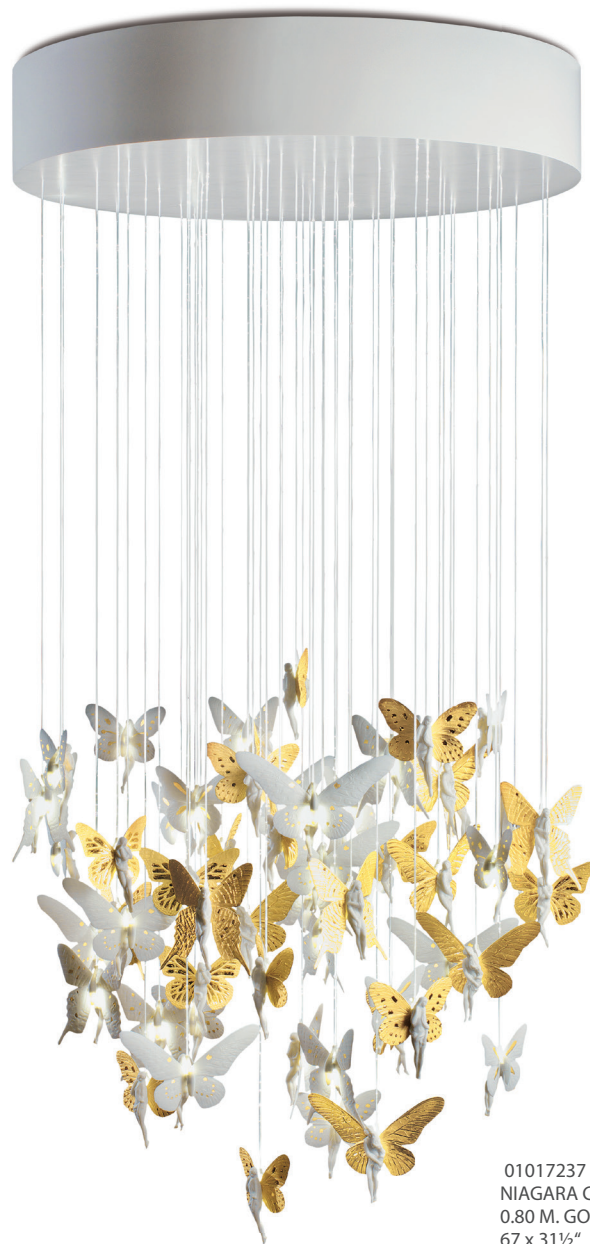
01017237 NIAGARA CHANDELIER 0.80 M. GOLD (US) 67 x 31½"