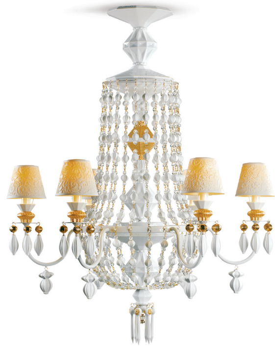
01023486 WINTER PALACE CHANDELIER 6 L. GOLD (US) 35½ x 27½"