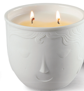
01040154 WINTER LANE CANDLE 6 1/4 x 4 1/4"