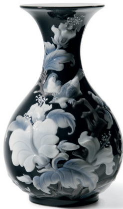
01008726 SPARROWS VASE (BLACK) 10¼ x 6¼"

Almost as if it was a canvas painting, the Lladró artists deploy all their skill and talent in these pieces, updating a product which is an excellent example of the brand's new aesthetic paths.