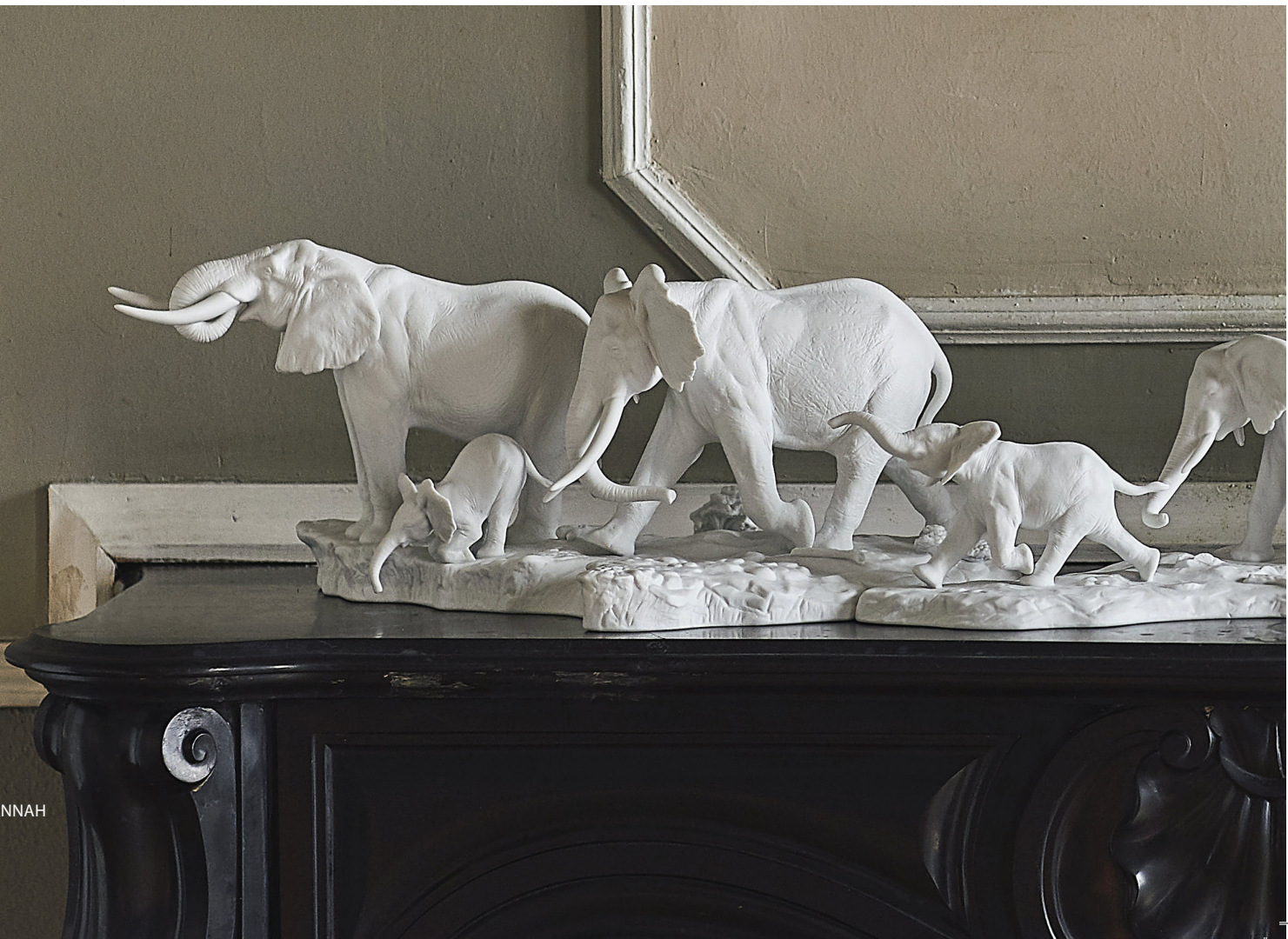
01009275 AFRICAN SAVANNAH Base included 11 1/2 x 47 1/4"