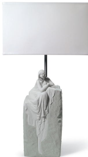
01008553 MEDITATING WOMAN LAMP I (US) 22½ x 11¾"