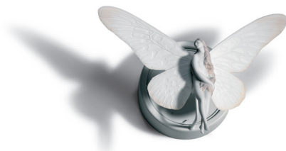
01017039 FAIRY LIGHT II WALL LIGHT (US) 8¼ x 5"