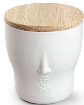
NOSE CANDLE 3¼ x 3¼ x 3¼"