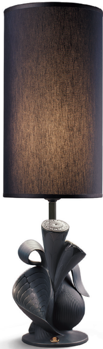
01023744 NATUROFANTASTIC - TABLE LAMP LIVING NATURE (BLACK) 21¼ x Ø 6¼"

In black or white, inspired by the wealth of tropical coloring or with the complex technique of golden luster, there are different decorative versions as well as models that come with fabric or translucent porcelain lampshades. Cheerful lamps that remind us that fantasy is relevant to modern design.