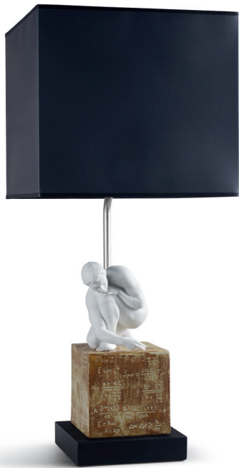
01023058 SCIENTIA - LAMP (US) 26½ x 11¾"

Lladró reinforces the functional aspect of its creations with a wide-ranging catalogue of lamps that are consolidating the brand's reputation within the lighting sector worldwide while still showcasing unparalleled sculptural qualities.