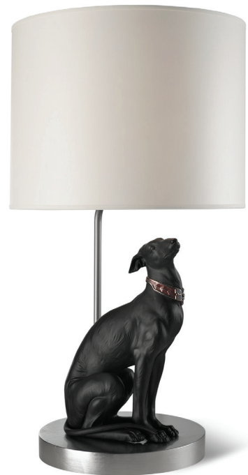
01023086 ATTENTIVE GREYHOUND LAMP (US) 27¼ x 13¾"