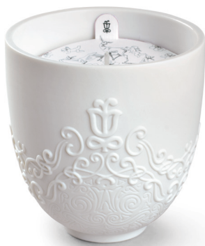
VOLUTES CANDLE 3¼ x 3¼ x 3¼"

Jasmine, orange blossom, vanilla, wood... Your home is your temple, your private space and your refuge, and there is a Lladro Home Fragrance that is just right for it. Natural essences combined with the artistic touch of handcrafted porcelain to decorate your home with aromas. Either in scented candles or in liquid perfume diffusers, Lladro Fragrances will ensure you a unique aromatic experience.