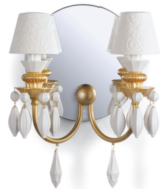
01023318 BDN -WALL 2L- GOLD (US) 14¼ x 11½"