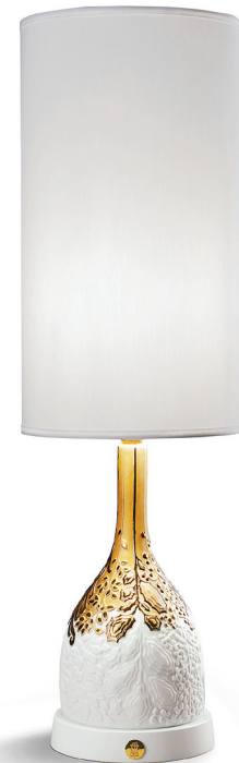
01023728 NATUROFANTASTIC - TABLE LAMP ORGANIC NATURE (GOLD) 20¾ x Ø 6¾"