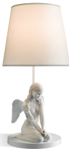
01023030 BEAUTIFUL ANGEL - LAMP (US) 19¼ x 9¾"