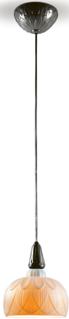
01023907 IVY&SEED PENDANT BLACK 86½ x 9"

The new Ivy&Seed collection gets off to a start with a wide range of models, sizes and colors that make it the most versatile in the Lladró catalogue, ideal to adapt to the tastes of individual clients as well as decorative contract projects. Available in models with 8, 16, 20 and 32 lights, these chandeliers come in five standard sizes, with the possibility to customize them by varying the height as well as the number and composition of the lights.