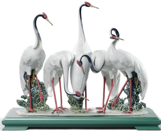
01008697 FLOCK OF CRANES Base included 17 3/4 x 8 3/4"