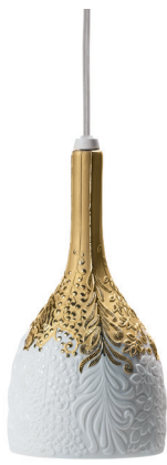
01007937 NATUROFANTASTIC HANGING LAMP GOLDEN (US) 67 x 4"