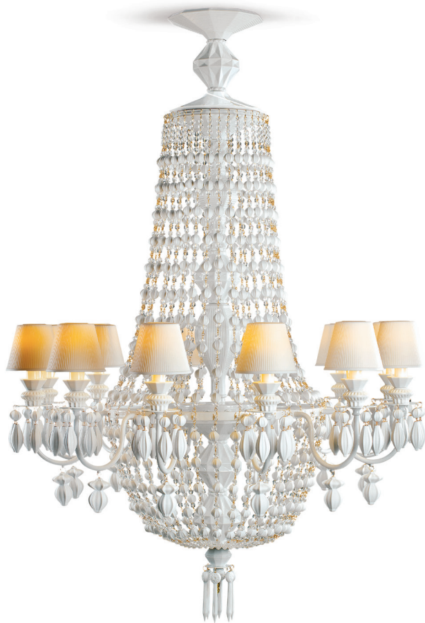
01023489 WINTER PALACE CHANDELIER 12 L. WHITE (US) 47¼ x 31½"

When turning them on, the transparency of the porcelain brings out the patterns etched by hand on the surface and bathes us in a warm, welcoming light.