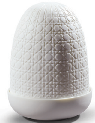
01023889 Wicker Dome Table Lamp 6" x Ø4¼"