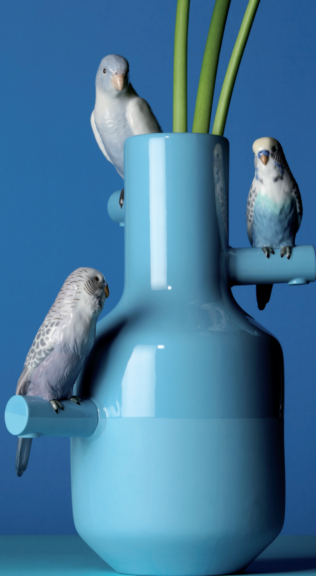
01007850 Parrot Parade Vase. Turquoise. 16¼" x 9¾"

Original vases, candelabra, lamps and mirrors combining the exquisite decoration of the birds with the pure forms of the objects. Lovebirds, cockatoos, parakeets and parrots reproduced down to the tiniest detail that seem to come to life on branches coming out of the vases, candelabras, coat-hangers and mirrors, with lineal shapes extremely difficult to achieve in a material as alive as porcelain.