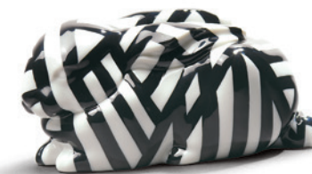
01009087 Sleeping Bunny (Dazzle) 2¾" x 5" x 3½"