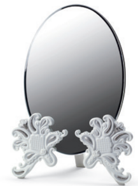
01007831 Vanity Mirror (White / Silver) 16¼" x 11½"