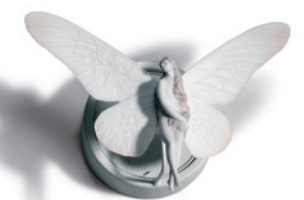
01017039 Fairy Light II Wall Light (US) 8¼ x 5"