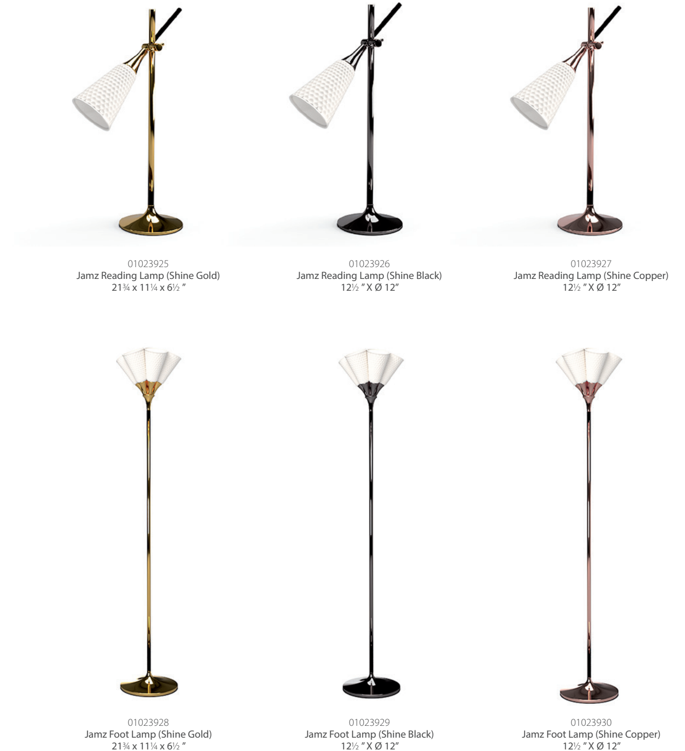
01023925 Jamz Reading Lamp (Shine Gold) 21¾ x 11¼ x 6½"

Jamz Collection offers lamps of refined forms in white porcelain with metals in gold, copper or black in which light and craftsmanship come together to create different atmospheres.