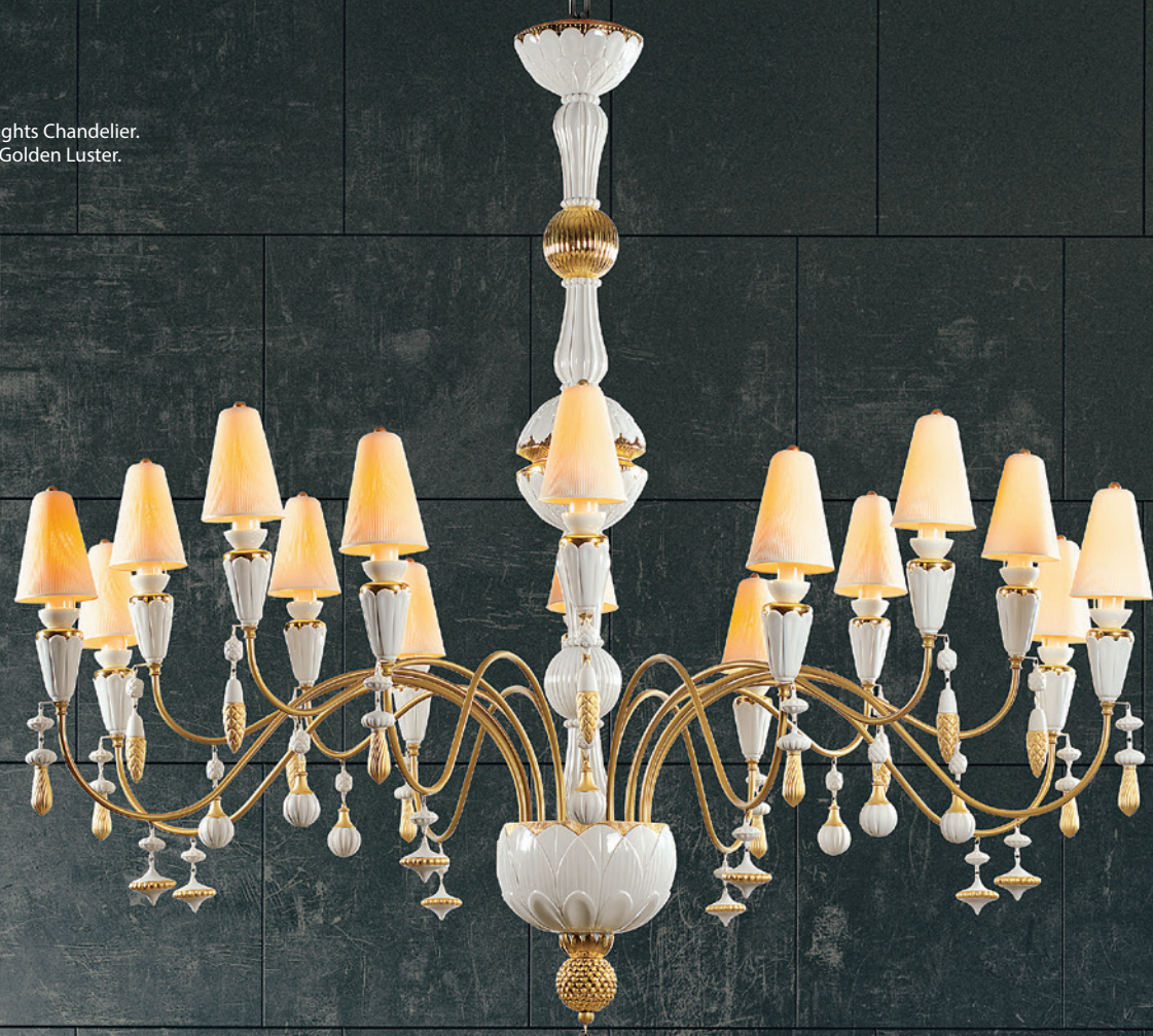
01023874 Ivy and Seed 16 Lights Chandelier. Large Flat Model. Golden Luster. (US) 51¼" x 59"