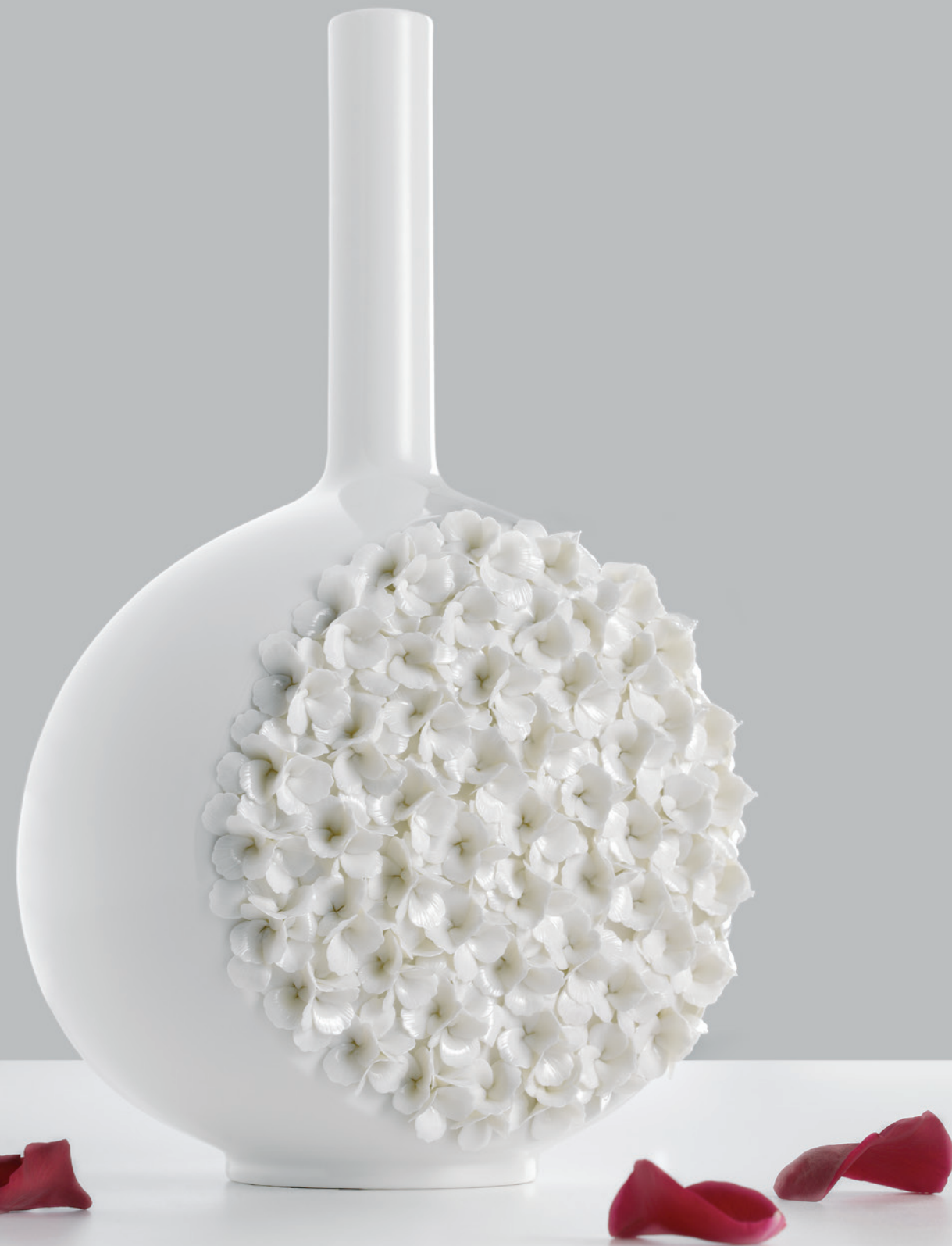
01007077 Canvas Vase Flowers Tapestry 15" x 9"