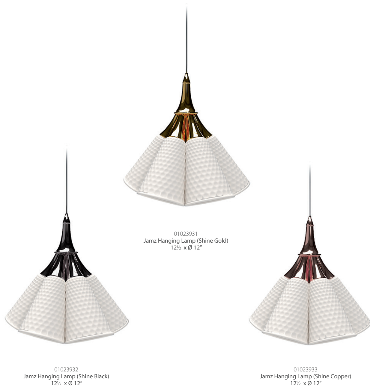
01023931 Jamz Hanging Lamp (Shine Gold) 12½ x Ø 12"

Jamz Collection is the first Lladró lighting collection that draws inspiration by jazz music to shape a singular selection of hanging, floor and reading lamps. The combination of metals with porcelain shades, to choose between three different models, recalls the shape of jazz instruments. The customization of the lamps symbolizes the free spirit of this music, allowing improvisation for bespoke creations.