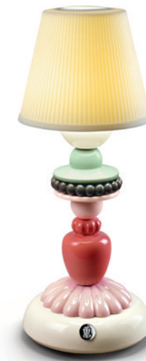
01023921 Sunflower Firefly Lamp (Ivory) 11¾" x Ø 4¾"

The firefly's magical quality of emitting light is the inspiration for this collection, a series of cordless table lamps with chargeable batteries and independent LED lights. Firefly lamps come with porcelain lithophanes as shades, whose translucent quality allows a warm, intense light to filter through. These are perfect for indoor and outdoor spaces. Their original designs are inspired by vegetal patterns and decorated with attractive combinations of colors that update table lamps in the unique language of porcelain.