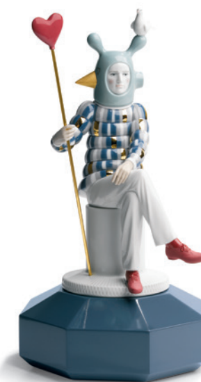
01007254 The Lover III Base included 15" x 8¾" x 7¾"

The creations in The Fantasy collection, designed in collaboration with Jaime Hayon, mirror the perfect fusion between the artistic quality of the brand's porcelain creations and the playful, fantasy quality the designer brings to his works. The balance between expression and function, the studied combination of Lladró's usual themes and the magic of the unexpected that Hayon is known for, make these pieces truly original objects that, over and above their decorative potential, are Lladró's must have.