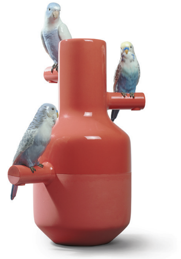
01007846 Parrot Parade (Coral) 16¼" x 9¾" x 7¾"