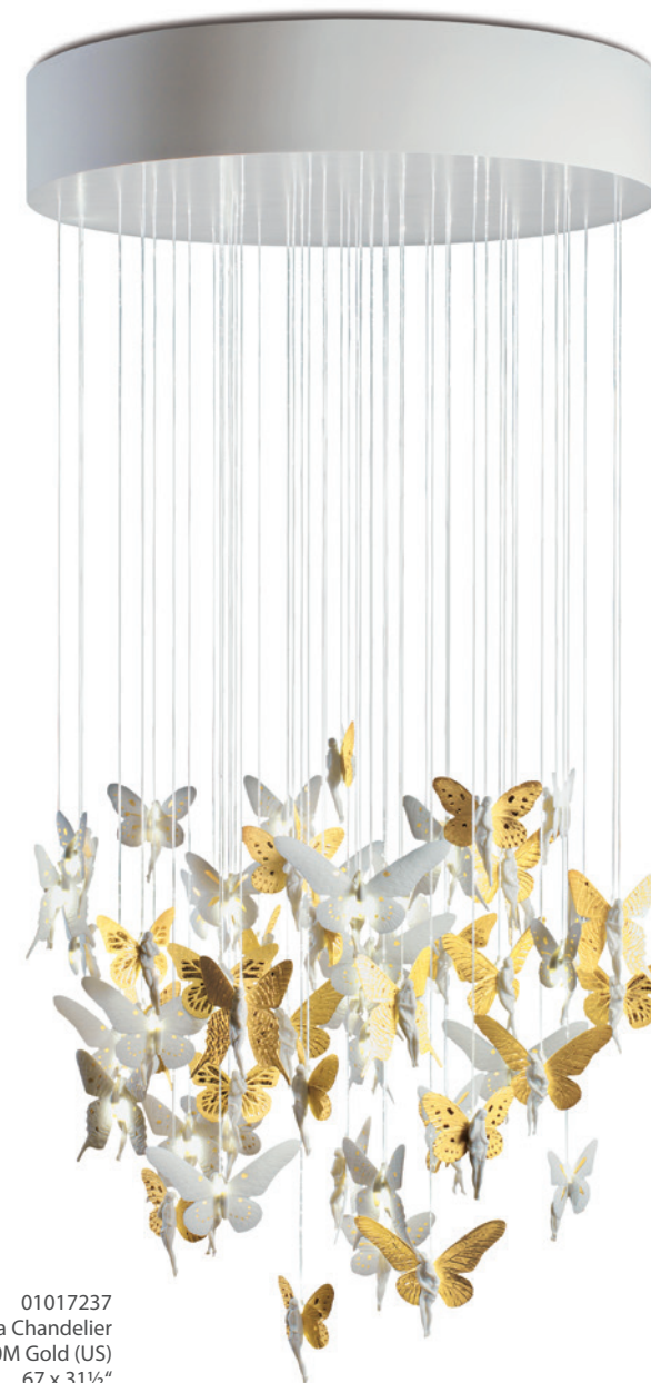
01017237 Niagara Chandelier 0.80M Gold (US) 67 x 31½"

The German Designer Bodo Sperlein focused on Nature using delicate elements of existing brand's pieces to create design lead products for Lladró's Re-Cyclos project. A collection of surprising decorative and functional pieces that underline the beauty and quality of detail of all Lladró works.