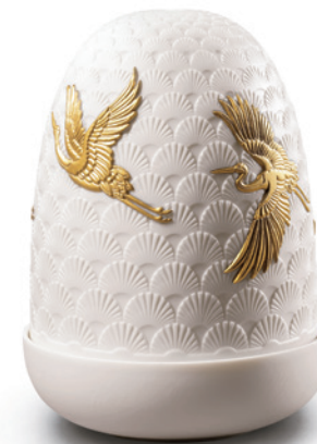
01023923 Cranes Dome Table Lamp 6" x Ø4¼"