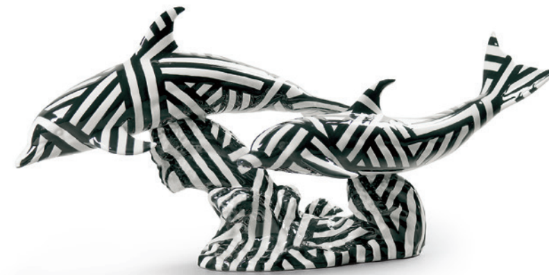
01009162 Dolphins' Dance (Dazzle) 7¾" x 16¼" x 6¾"