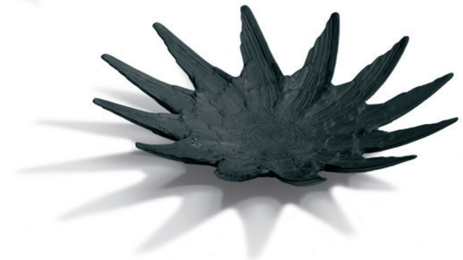
01017059 Papagena Bowl (Black) 3 1/2" x 15 3/4"