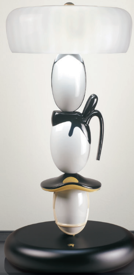
01017248 Hairstyle (H/I/M) Table Lamp (US) 22¾" x Ø 12"

The Hairstyle collection of lamps from Lladró Atelier has been created in collaboration with the Japanese designer Hisakazu Shimizu. The lamps are inspired by historical Japanese characters and their unique hairstyles.