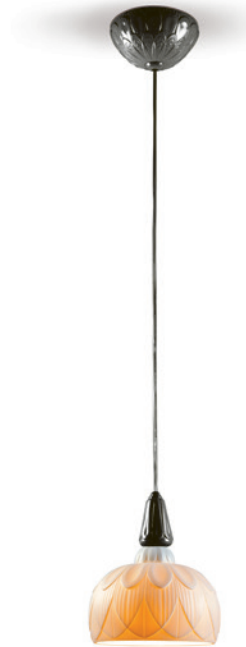
01023907 Ivy & Seed Pendant Black 86½" x 9"