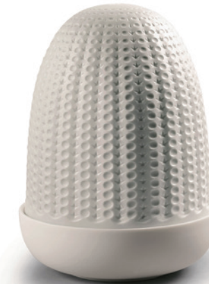
01023923 Cactus Dome Table Lamp 6" x Ø4¼"