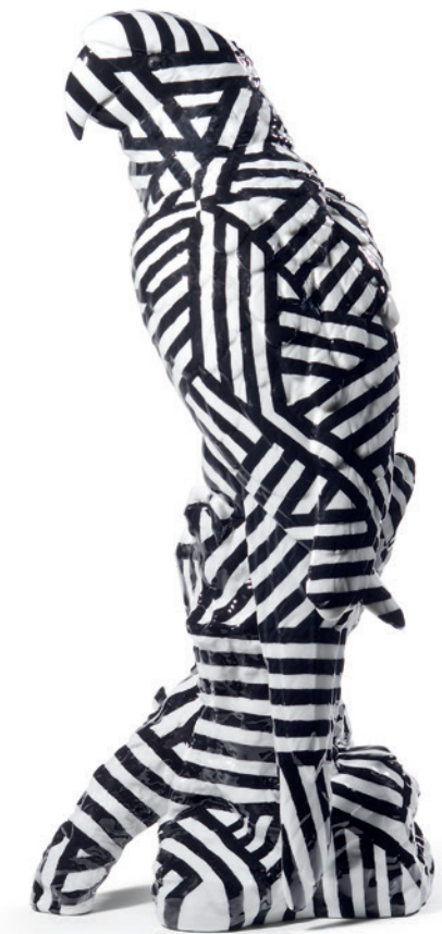
01009078 Macaw Bird (DAZZLE) Limited edition of 500 pieces 18" x 7¾" x 7¾"