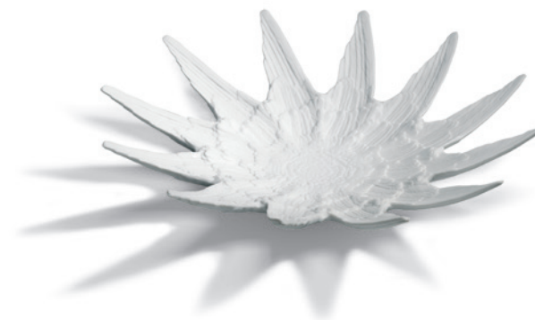
01017058 Papagena Bowl (White) 3 1/2" x 15 3/4"