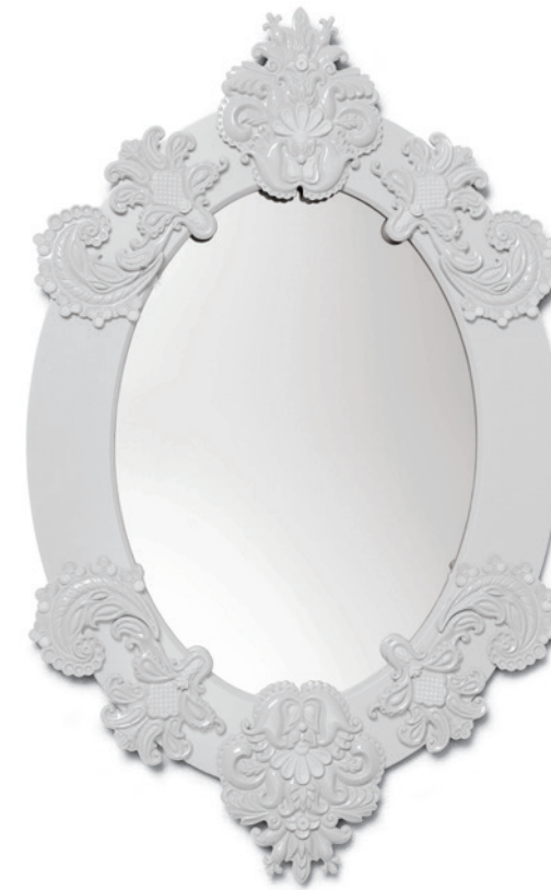
01007773 Oval Mirror (White) 36½" x 22¾"