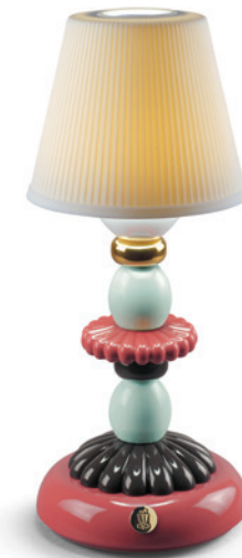
01023760 Lotus Firefly Lamp (Golden Fall) 11" x Ø 4¾"