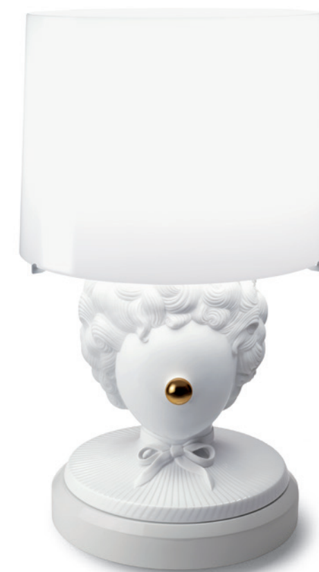
01007272 The Clown Lamp 23½" x 13¾"