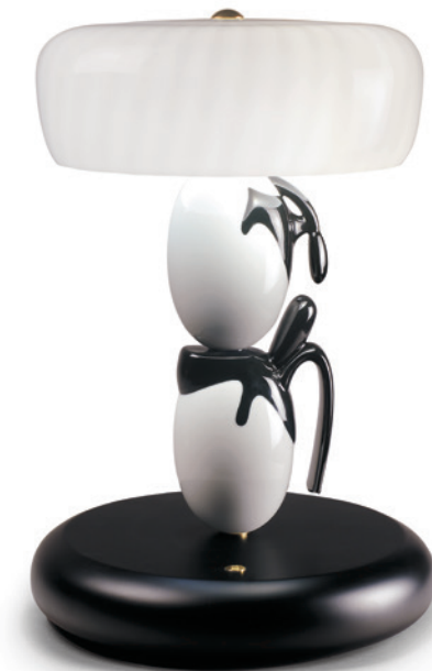
01017256 Hairstyle Lamp (I/U) (US) 15" x Ø 12"