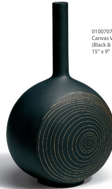
01007078 Canvas Vase Tree Rings (Black & Gold) 15" x 9"