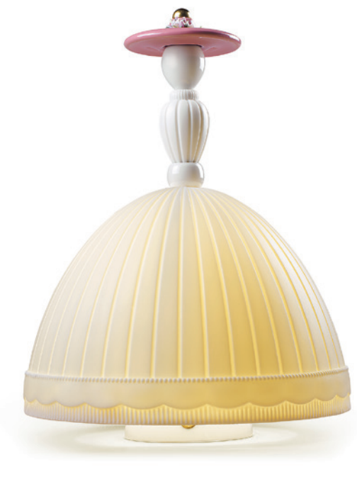
01023668 Mademoiselle Table Lamp Elisabeth 13½ X Ø 10¼"