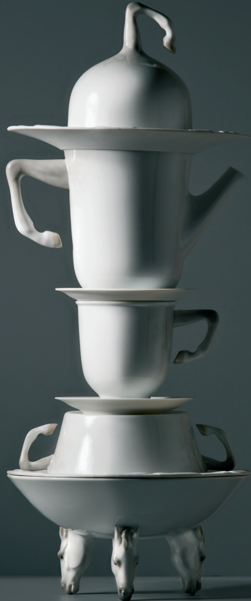
01017149 Equus Butter Dish 4 3/4 x 7 3/4 x 7 3/4"