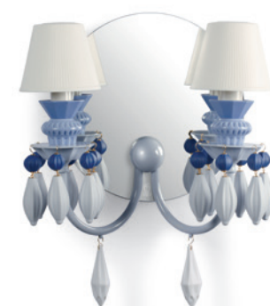
01023258 BDN Wall 2L. Blue (US) 14¼" x 11½"

Lladró's Belle de Nuit lamps speak to us in a new language of porcelain and color. They give off a warm light thanks to the lithophanes as shades, engraved with different decorative motifs. The rest is down to the wealth of Lladró's palette of colors: from the most classic model in white to the fun multicolor version, Belle de Nuit lamps decorate, illuminate and, above all else, add that exclusive magical touch to your favourite rooms.