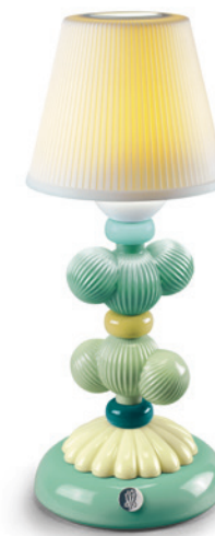
01023766 Cactus Firefly Lamp (Green Cactus) 11½" x Ø 4¾"