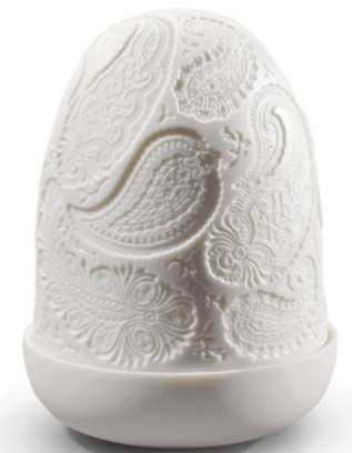
01023919 Paisley Dome Table Lamp 6" x Ø4¼"