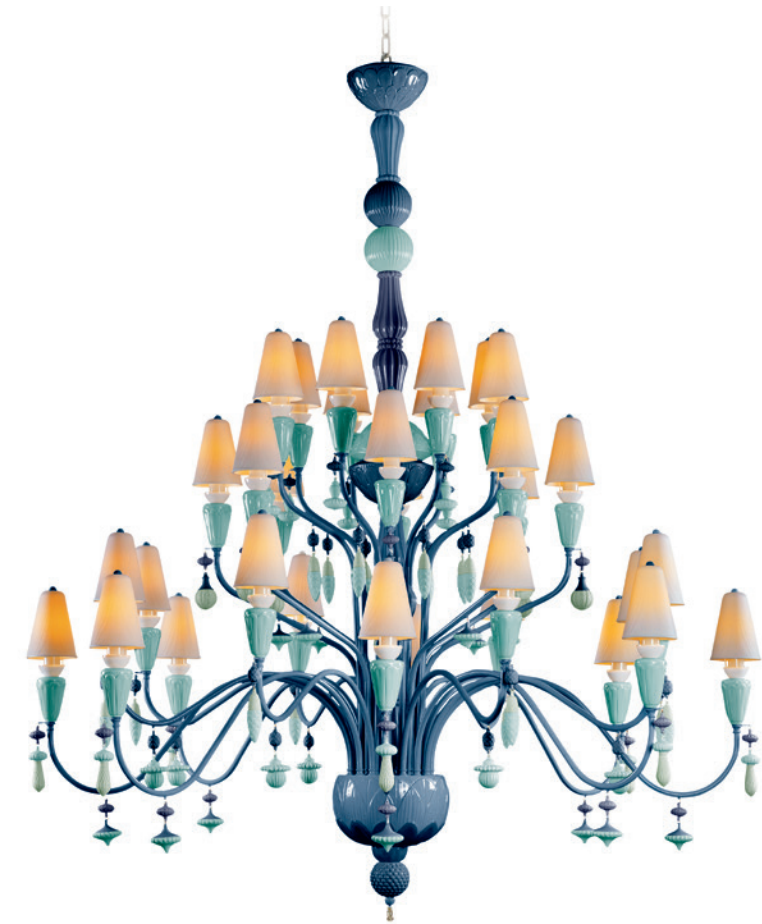
01023847 Ivy & Seed Chandelier 32 L. Ocean 65" x 59"