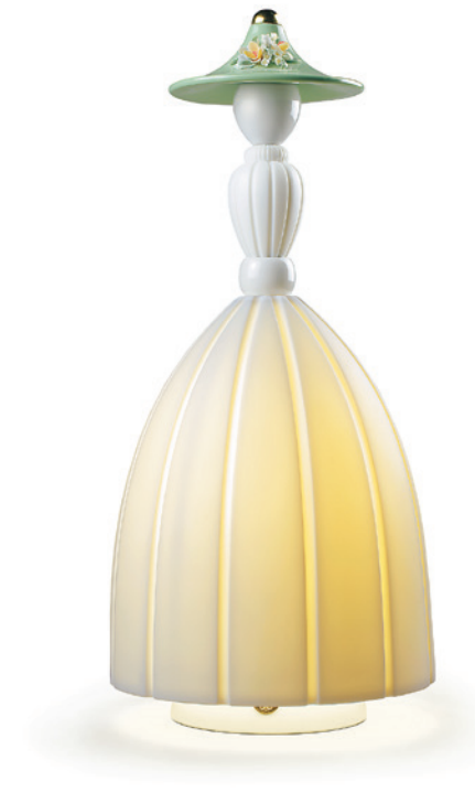
01023664 MADemoISELLE TABLE LAMP DANIELA 14½" x Ø 6¾"

Coquettish, refined and romantic, Lladró's elegant ladies have been transformed into lamps in the Mademoiselle collection. The light is filtered through the translucent porcelain of their vaporous white "skirts" and projects the decorative pattern etched on the surface in a magical effect. The beautiful headdresses are decorated with Lladró flowers, handcrafted petal by petal, and speak to us of the eternal feminine beauty in a fresh and colorful language.