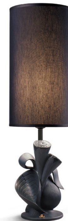
01023744 Naturofantastic Table Lamp Living Nature (Black) 21¼" x Ø 6¼"