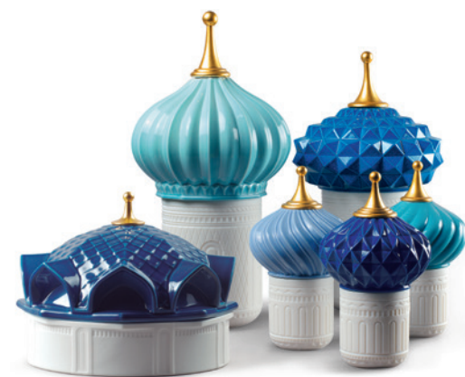
Also available in Blue Fragrance ■ Unbreakable Spirit

LLadró invites you to an exotic journey in a collection of diffusers and scented candles inspired by the fascinating and mysterious Orient. The vases in the 1001 Lights Collection are entirely made in porcelain and their evoking shapes and colors are perfect for relaxing and enjoying your private moments. Once the wax or the liquid is consumed, they can be used as functional objects with an attractive design that look nice grouped together.