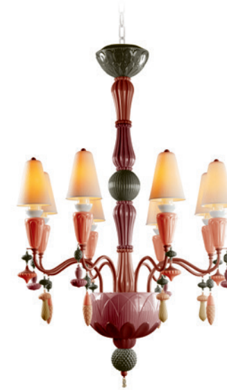
01023808 Ivy & Seed Chandelier 8 L. Red 41¼" x 27½"

The new Ivy&Seed collection gets off to a start with a wide range of models, sizes and colors that make it the most versatile in the Lladró catalogue, ideal to adapt to the tastes of individual clients as well as decorative contract projects. Available in models with 8, 16, 20 and 32 lights, these chandeliers come in five standard sizes, with the possibility to customize them by varying the height as well as the number and composition of the lights.