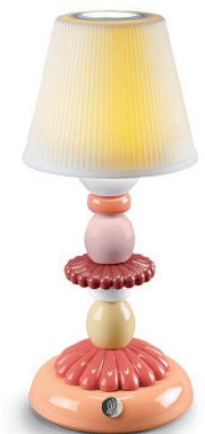
01023760 Lotus Firefly Lamp (Coral) 11 x Ø 4¾"