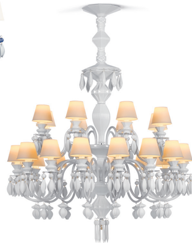
01023195 BDN Chandelier 24L. White (US) 39¼" x 31½"