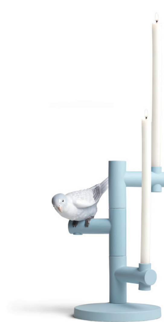
01007859 Parrot Icon 11¾ x 6¾ x 6¾"