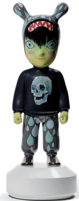
01007279 The Guest By Tim Biskup (Big) Limited edition Base included 20½" x 7½"