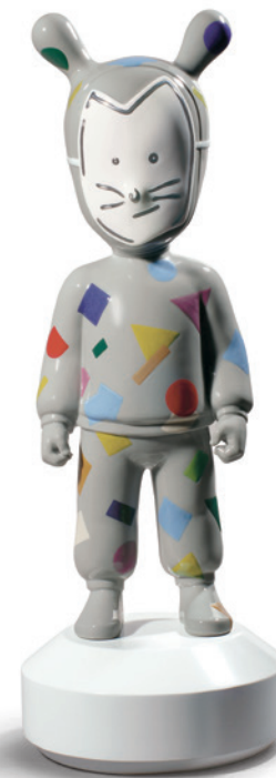
01007730 The Guest By Paul Smith (Big) Limited edition Base included 20½" x 7½"

Unexpected, captivating, unique... this is The Guest , a ground-breaking character created by Jaime Hayon for Lladró Atelier, a world of new experiences in porcelain where in-house designers and external artists bring their own unique ideas to life, giving a distinctive personality to this singular porcelain being. The Guest collection includes spectacular limited edition, numbered series and monochromatic pieces in different sizes and colors for the most modern interiors.