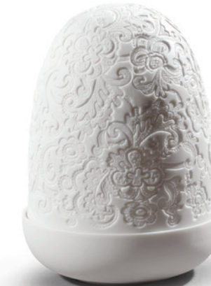
01023890 Lace Dome Table Lamp 6" x Ø4¼"