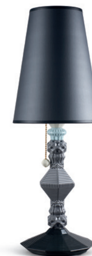
01023222 BDN Table Lamp. Black (US) 22½" x 7¾"