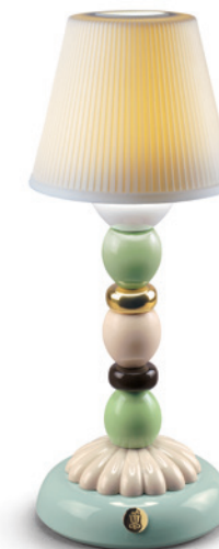
01023793 Palm Firefly Lamp (Golden Fall) 11¾" x Ø 4¾"