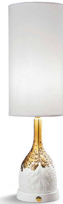
01023728 Naturofantastic Table Lamp Organic Nature (Gold) 20¾" X Ø 6¾"