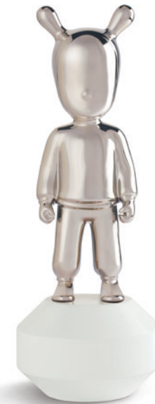
01007740 The Silver Guest (Small) Base included 12" x 4½"