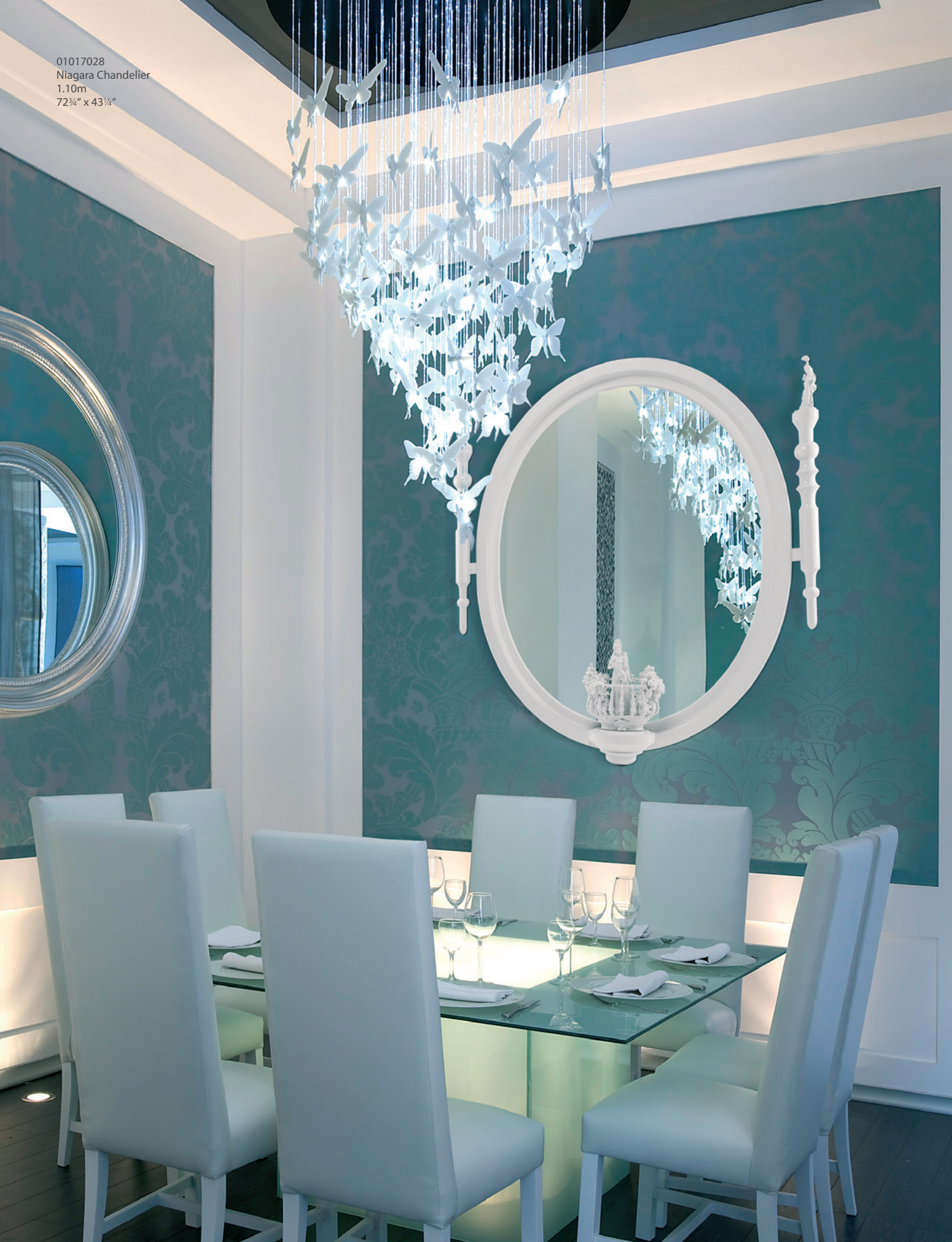
01017028 Niagara Chandelier 1.10m 72¾" x 43¼"