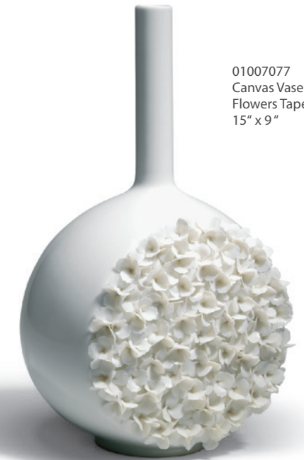
01007077 Canvas Vase Flowers Tapestry 15" x 9"