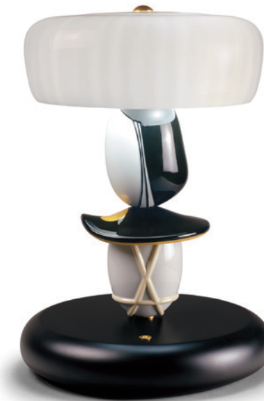
01017252 Hairstyle Lamp (H/M) (US) 15" x Ø 12"