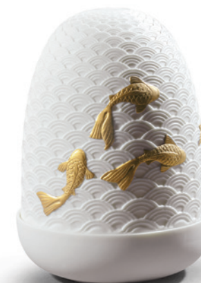
01023888 Koi Dome Table Lamp 6" x Ø4¼"