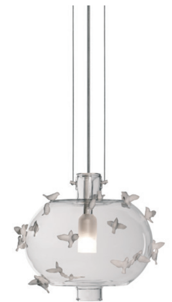
01017047 Freeze Frame I Hanging Lamp (US) 67 x 9½"