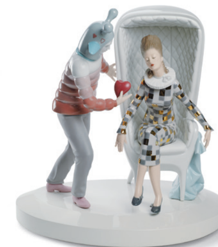
01007270 The Love Explosion Base included 14¼" x 13½"