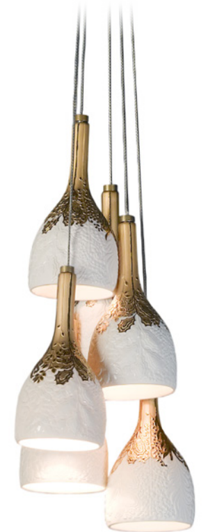
01023149 Naturofantastic 6 Lights Lamp (US) 67" x 15¾"